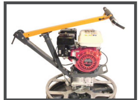
FOLDING HANDLE FOR EASY STORAGE